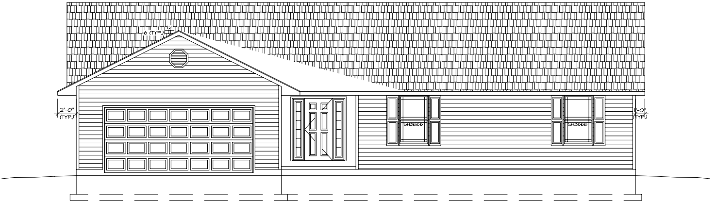
FRONT ELEVATION A-1 SCALE: 1/4"=1'-0"